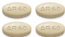
Tablets shown are actual size.

ERLEADA® is indicated for the treatment of metastatic castration-sensitive prostate cancer (mCSPC) or for the treatment of non-metastatic castration-resistant prostate cancer (nmCRPC).